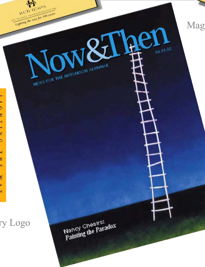
In House Publication