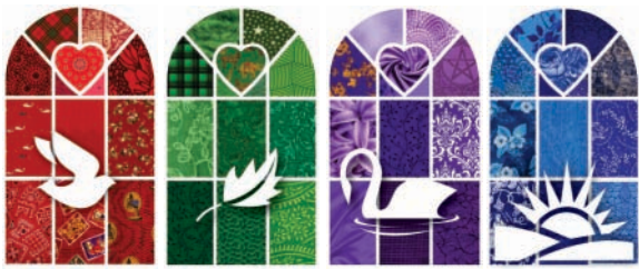
Assisted Living Memory Care Independent Living Skilled Nursing