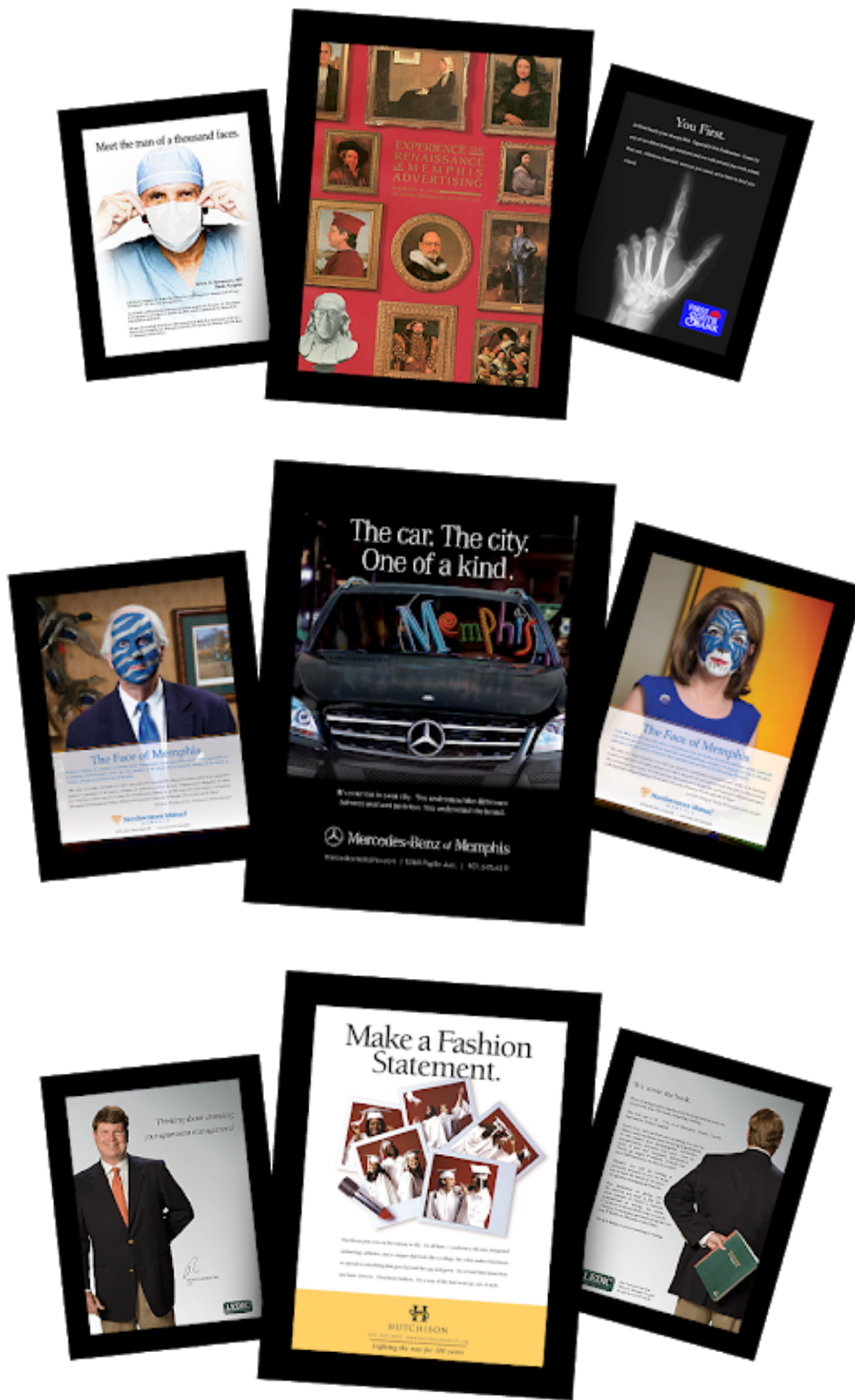
A sampling of Anderson Humphreys Advertising campaigns and design work.