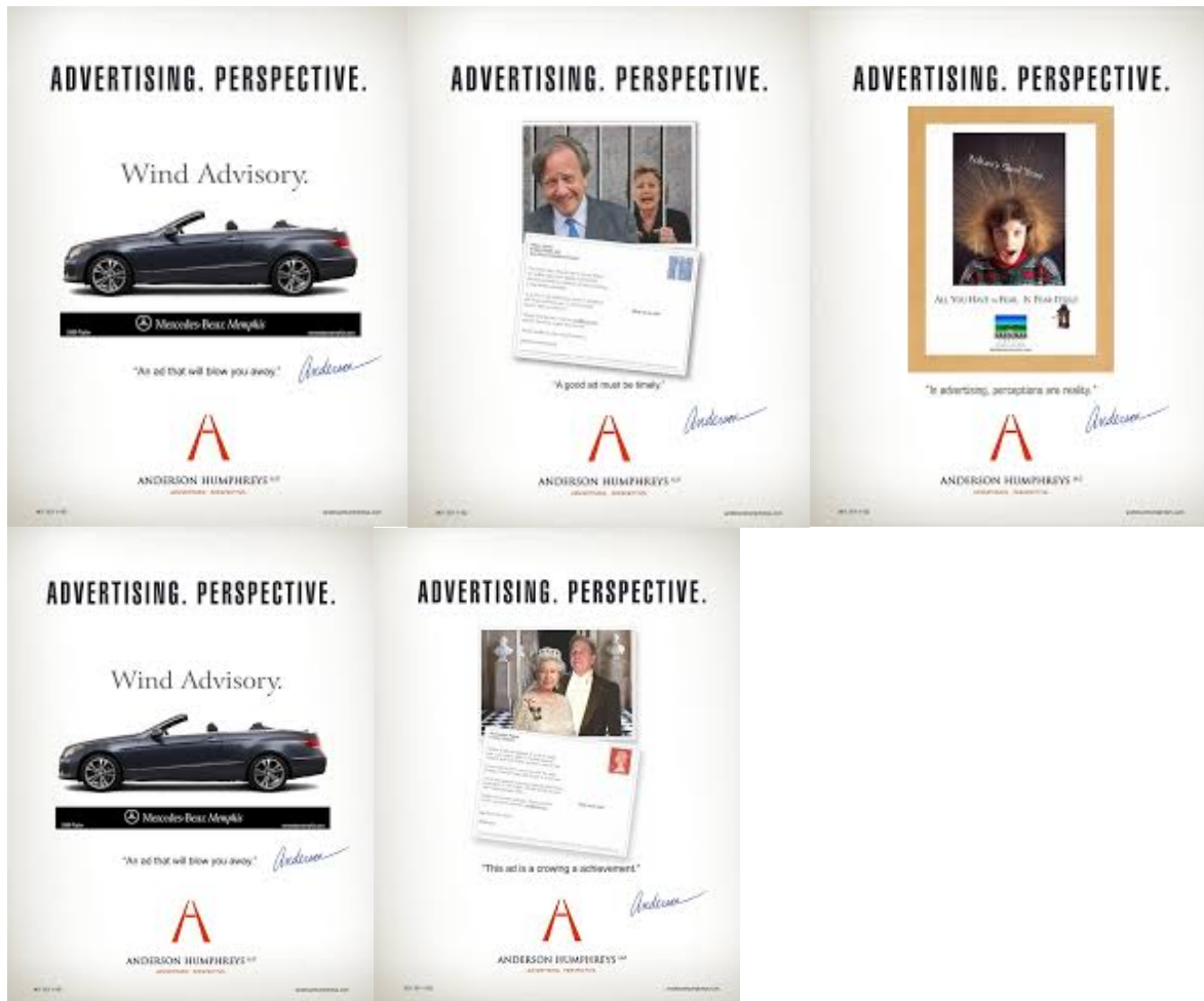
A series of self-promotion ads for Anderson Humphreys LLC.