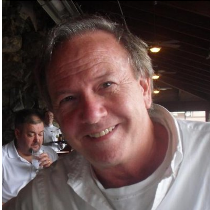
Current day Anderson – still ready to take on the World.